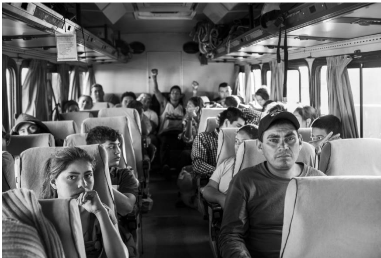
Migrants board a bus in Navojoa